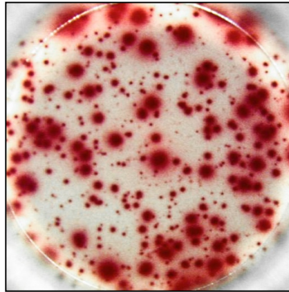
Stimulus: PMA/ionomycin ( 1 \times 10^4 cells/well)

Example of IFN- \gamma specific spots produced by human PBMC. Preincubation: 42h, incubation ELISPOT: 20h.