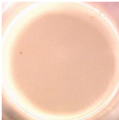
Stimulus: none ( 2 \times 10^5 cells/well)