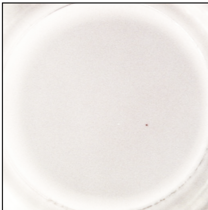
Stimulus: none ( 2 \times 10^5 cells/well)

Example of IL-4 specific spots produced by mouse (Balb/c) splenocytes. Preincubation: none, incubation ELISPOT: 24h.