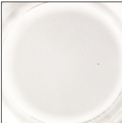
Stimulus: none ( 2 \times 10^5 cells/well)