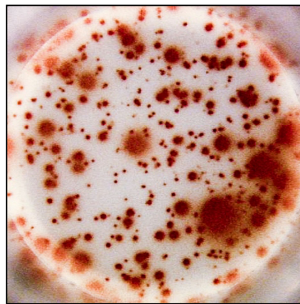
Stimulus: PMA/ionomycin ( 1 \times 10^4 cells/well)

Example of IFN- \gamma specific spots produced by rhesus macaque PBMC. Preincubation: 42h, incubation ELISPOT: 20h.